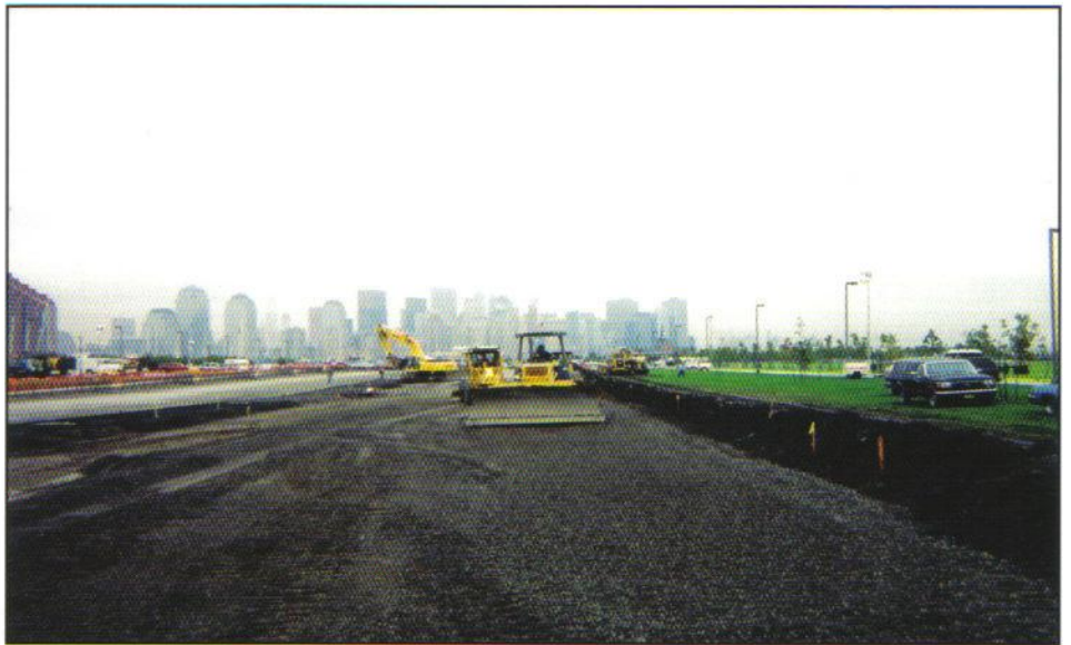
Stone base for parking areas at the park.