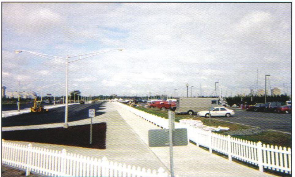
Park work near completion.