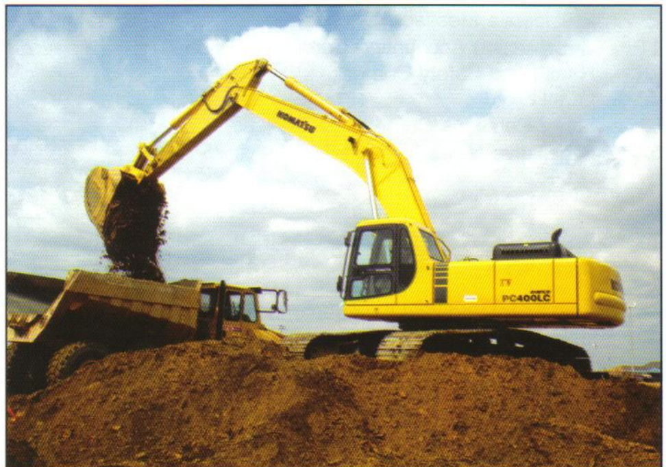
Mount Construction excavator loads material at southern New Jersey site work.