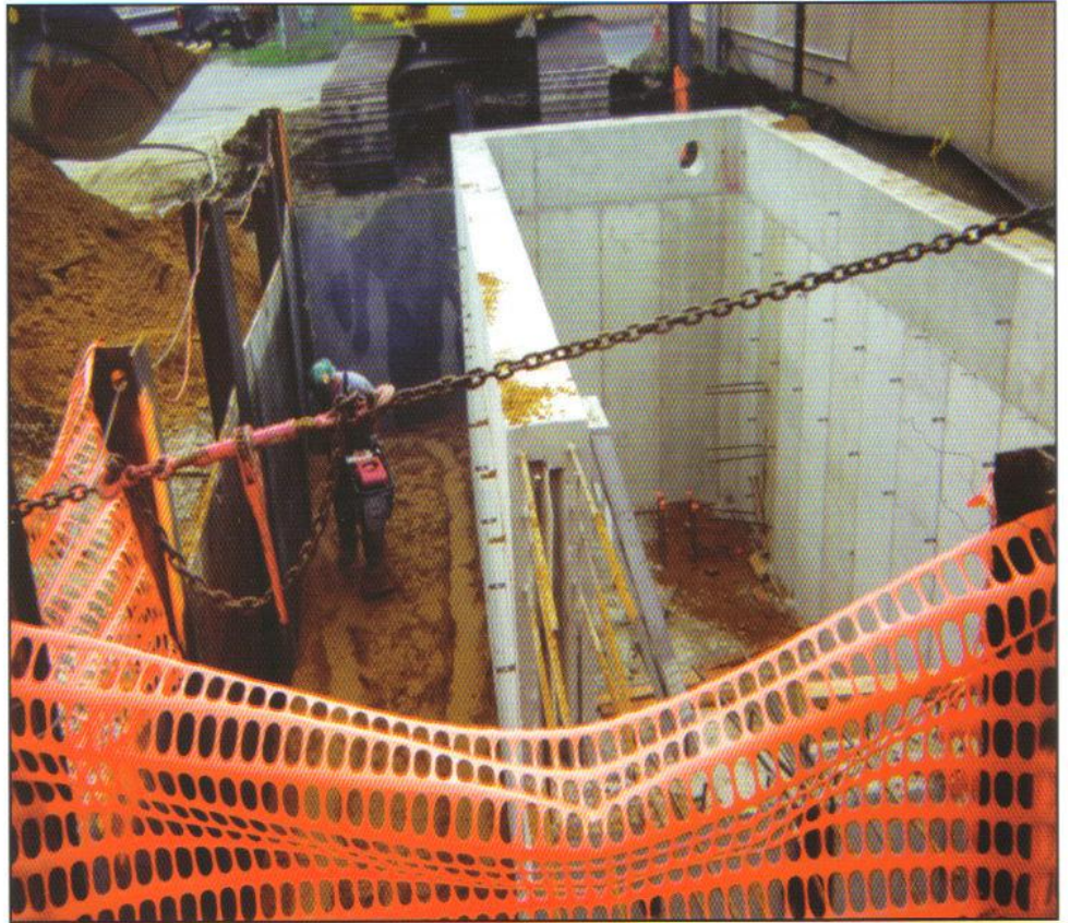
Installation of concrete sludge tank in Mt. Holly.